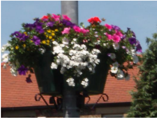
One of the new hanging baskets on Commercial Road in Skelmanthorpe

For the third year running, the Parish Council has provided hanging baskets around the parish. Sharp eyed residents will notice that the style of the baskets has changed; the new baskets are self watering and should, therefore, be able to withstand any heatwave which we might enjoy this summer.