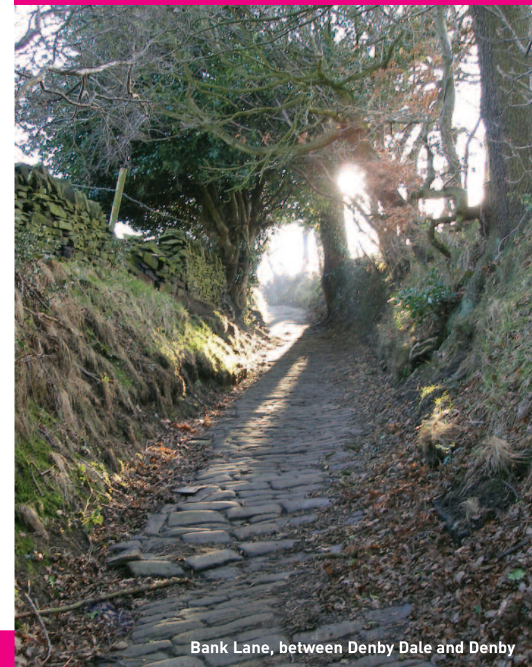
Bank Lane, between Denby Dale and Denby

An 11 mile walk round the Denby Dale district. Stout footwear is advisable.