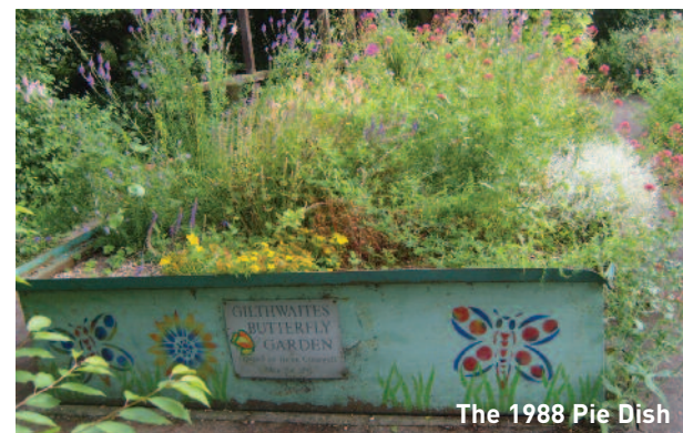
The 1988 Pie Dish

Trains to Denby Dale from Huddersfield, Penistone, Barnsley and Sheffield run hourly Monday to Saturday with 8 trains each way on Sundays.